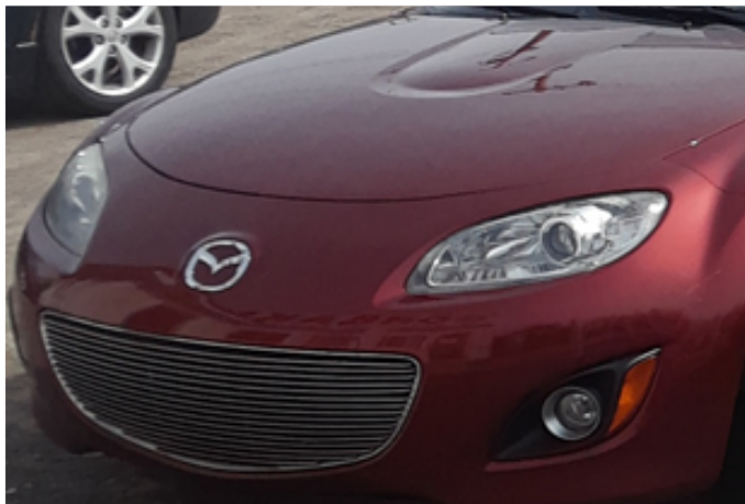
OLD, Lots of hazing on headlamps and small white spots

P.S. I redid the aftermarket grill myself. The jury's still out on whether I change it a bit.