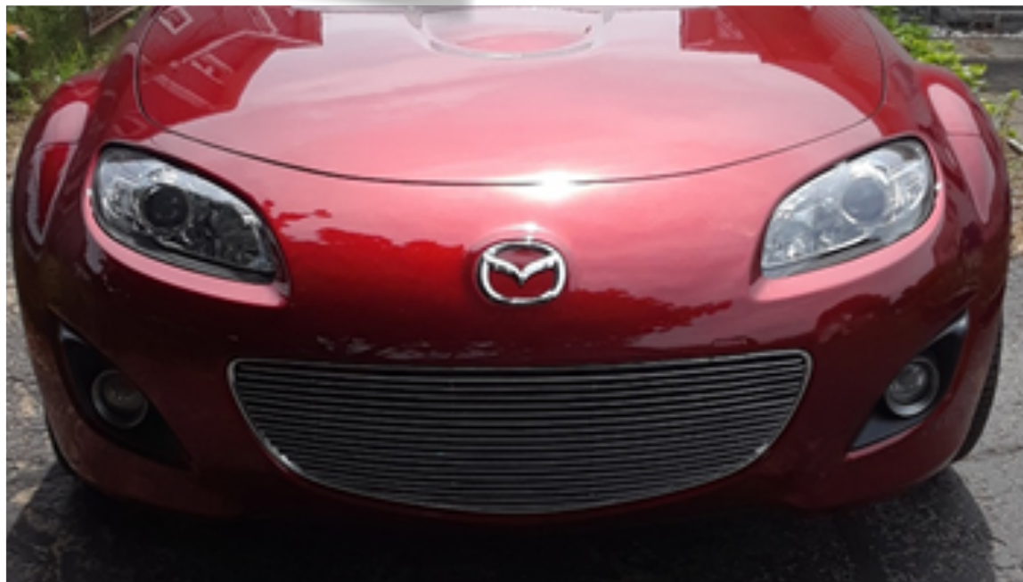
NEW, Showroom ready!